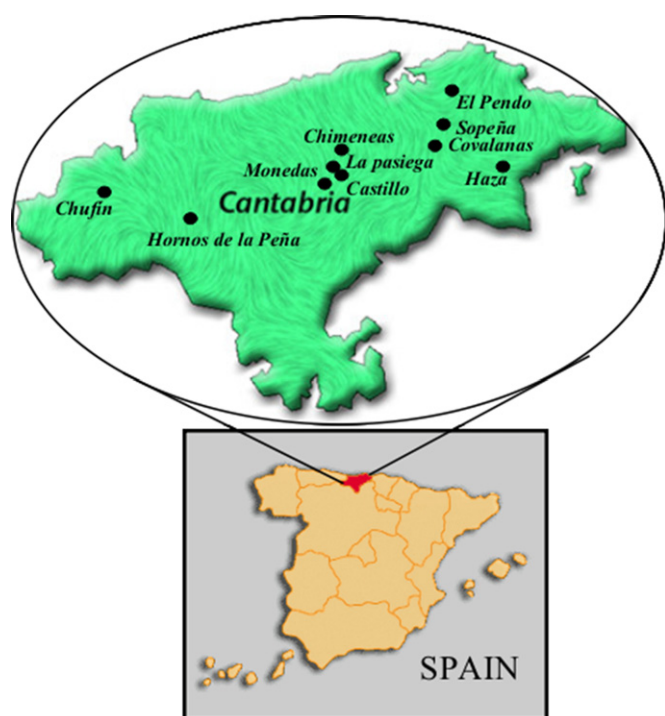
Fig. 1. Location of the caves in the Cantabria region in Spain.

Figs. 2 and 3 show the continuous radon monitoring in the cave of Castillo and Monedas, respectively. As it can be seen no significant variations in radon concentrations could be observed